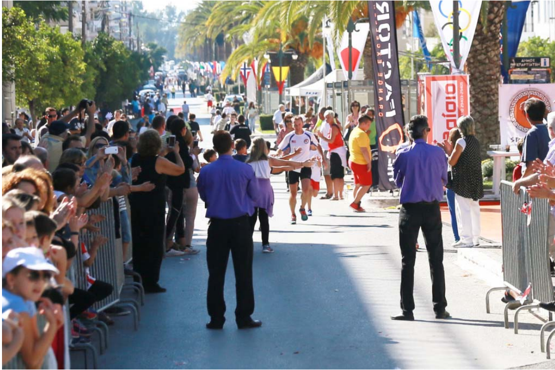
The magical finish, king Leonidas in view!

At last, down into the main street heading into Sparta. Sure enough, the kids came out on their bikes, I wanted to shout “ Kalimera ” or ask what their names were, but was too tired. Up the main drag, turn right, then right again. People cheered; cars honked. At 400 meters away, I could see the flags. Sure enough, there was a surge of new energy and I picked up the pace. I ran down the street, the crowd grew, I heard the music, then my name announced, people clapping and I was there – up the steps and touching the feet of King Leonidas.