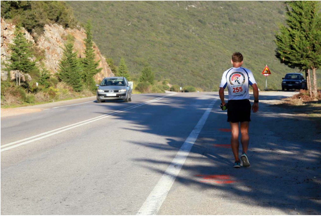
Exhausted, nearing the end