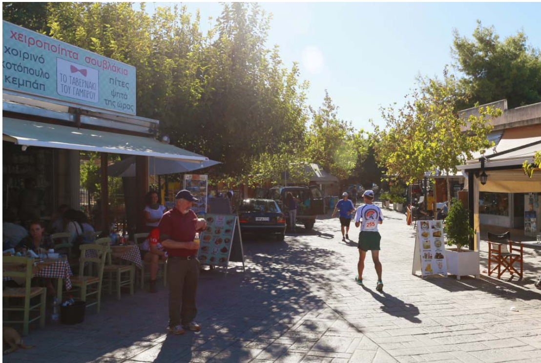
Leaving Ancient Corinth as the late afternoon sun starts to sink into the sky

The sun was setting as I was running along a quiet road that wound up through hills nestled with olive groves. The light dancing in the trees was beautiful. I felt alive.