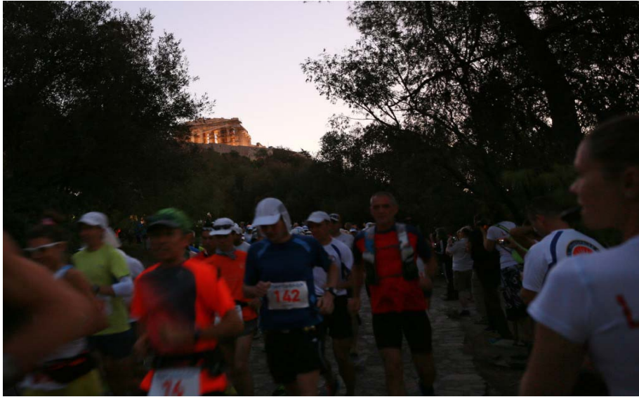
The race starts!