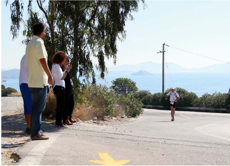
Running along the coast before Corinth

As I started approaching the marathon mark, I could feel my hamstrings start to quiver. The feeling is hard to describe – a weird, tremor-like feeling deep down below my quad that says “Whoa!- Fragile!” when I land. It didn’t really hurt, but didn’t reassure me.