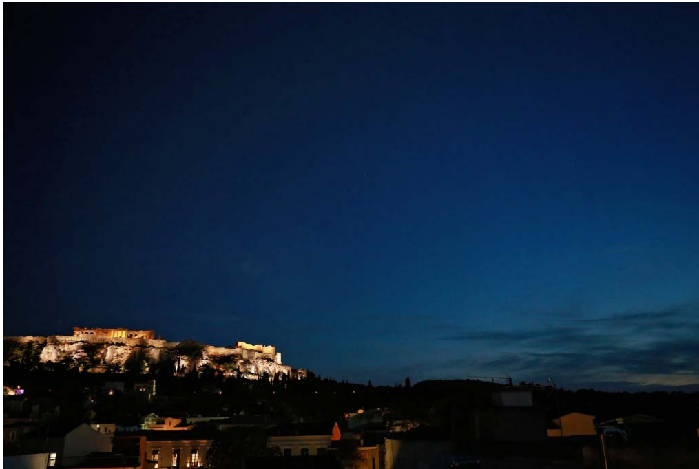
The view from the restaurant Wednesday evening

It was fun meeting the other runners. I've never been in a group of such high-caliber running talent, chatting with them increased my sense of privilege just to participate in the race, but also increased my apprehension at how I would do. Talking to them, I felt like the 100 miler was the new 5k — small potatoes. It wasn't interesting to share which races you had run, but which 100 milers you had won and which races you directed. Runners had stories of 24 hour races (how many miles you could go in 24