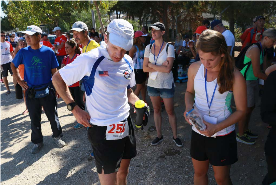
station stop - Gatorade, salty bars, whatever else looks good

technology in 1893. The narrow gorge plunged nearly straight down, with a ribbon of blue water, straight as an arrow, at the bottom.